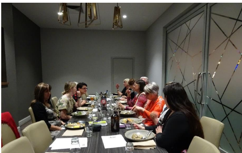
South Metro Branch dinner November 2018 at Bentleigh RSL